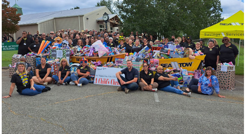
Dollar General and Sea Tow Toy Collection for A Child’s Christmas