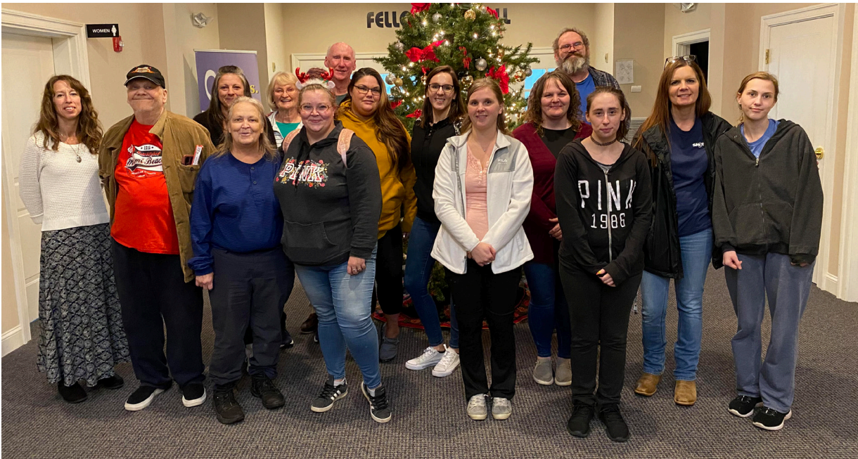
12 graduates from the Fall 2022 Getting Ahead Class are pictured with New Tomorrow's Staff, Facilitator and Volunteers.

I will fill my future with moments, tiny as they may be. Small blips that build upon each other into a lifetime. I will continue to strive towards the brightness that dissipates the grey around me. I will allow the caring embrace of my own soul to enwrap my mind and push me forward, towards the life I have always deserved. A life full of living, deepened with love and success.